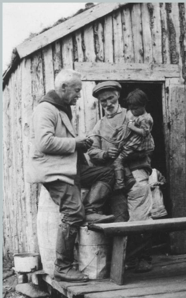
Dr. Grenfell at Seal Islands 1932.

Dr Wilfred T. Grenfell came to the coast of Labrador in 1892 on behalf of the Royal National Mission to Deep Sea Fishermen. His job was to assess the living conditions and needs of remote fishing communities in Labrador and northern Newfoundland. His findings changed his life, and the lives of the people he served. Finding Grenfell tells the story of the many nurses, workers and volunteers who contributed to the success of the mission and its legacy.